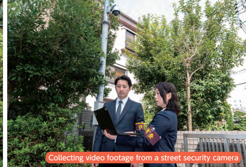
Collecting video footage from a street security camera