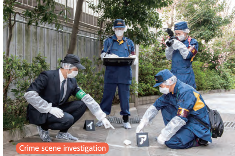
Crime scene investigation