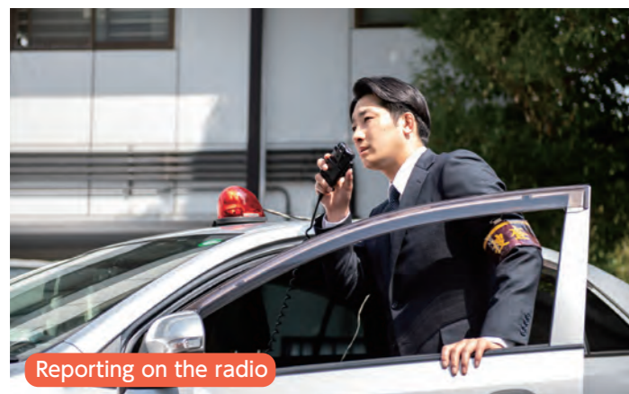
Reporting on the radio