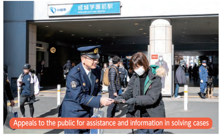
Appeals to the public for assistance and information in solving cases

We would greatly appreciate your cooperation in providing any information leading to the arrest of suspects