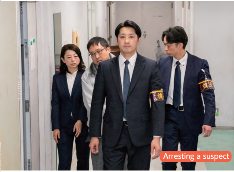
Arresting a suspect